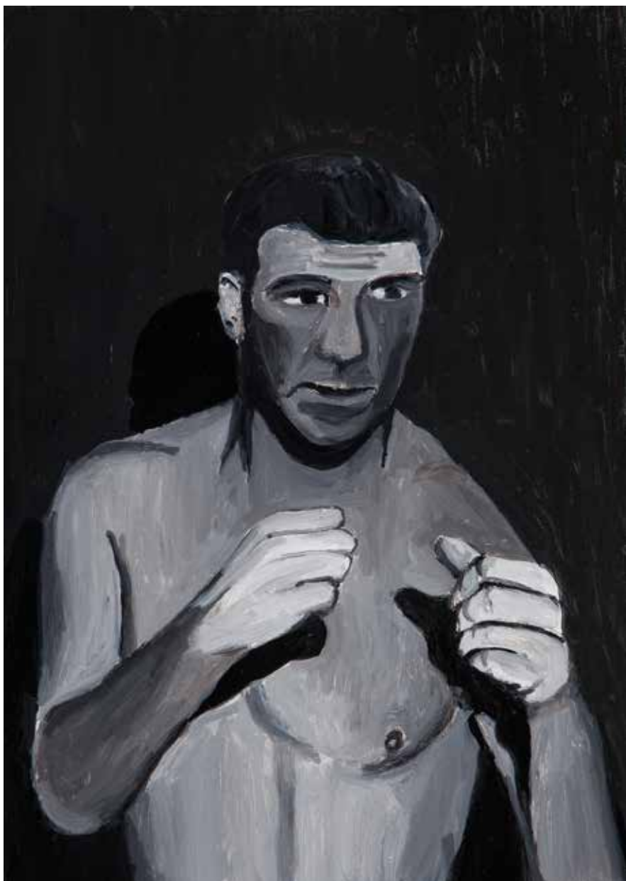
Right RICHARD LEWER In the Blue Corner , 2014 oil on board 30 x 22 cm Left RICHARD LEWER In the Blue Corner , 2014 oil on board 30 x 22 cm