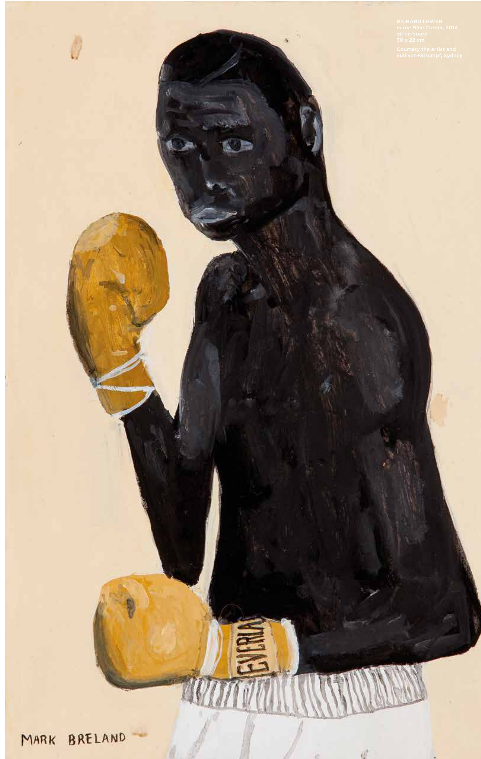
RICHARD LEWER In the Blue Corner , 2014 oil on board 30 x 22 cm